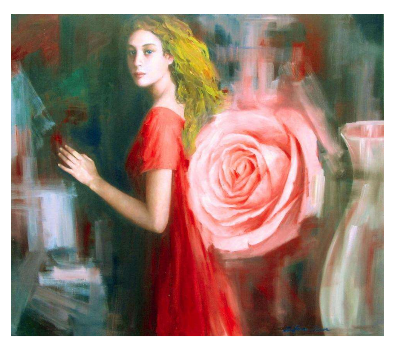
Pink Seduction oil on canvas 50" x 60" 2006