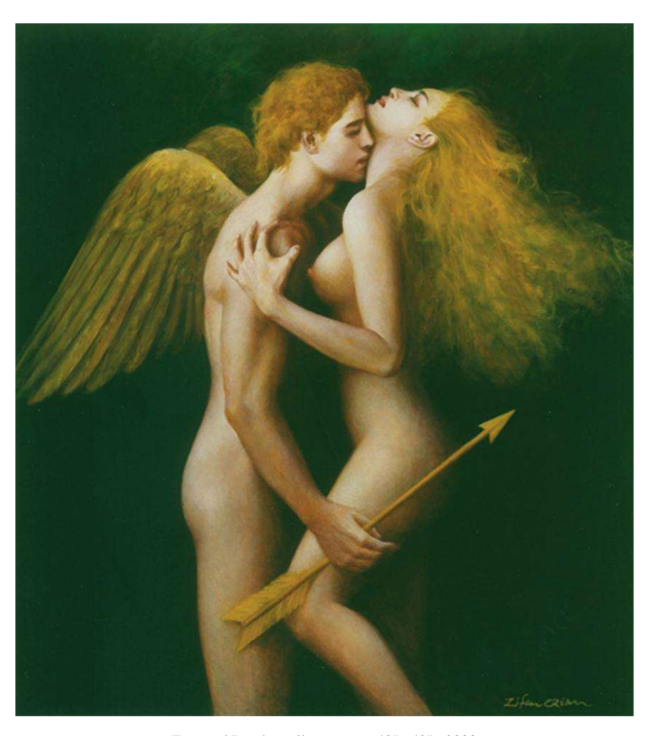
Eros and Psyche oil on canvas 48"x 42" 2003