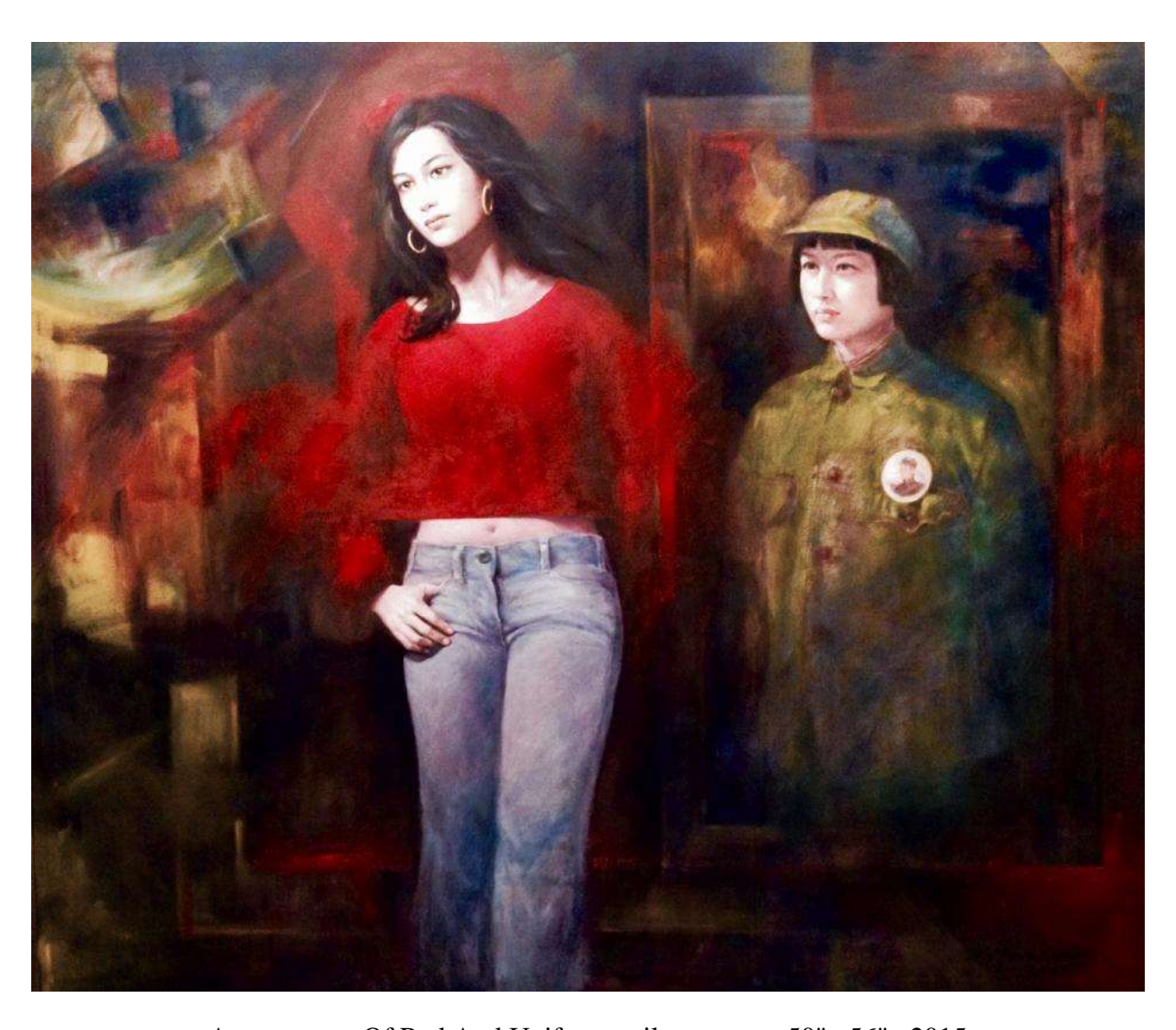
Appearances Of Red And Uniform oil on canvas 50"x 56" 2015