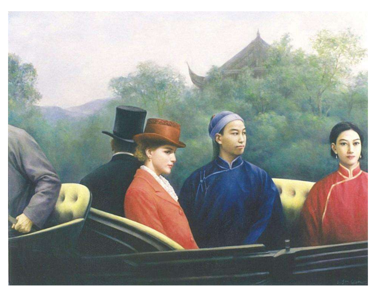
Traveling Companion oil on canvas 38"x 50" 1994