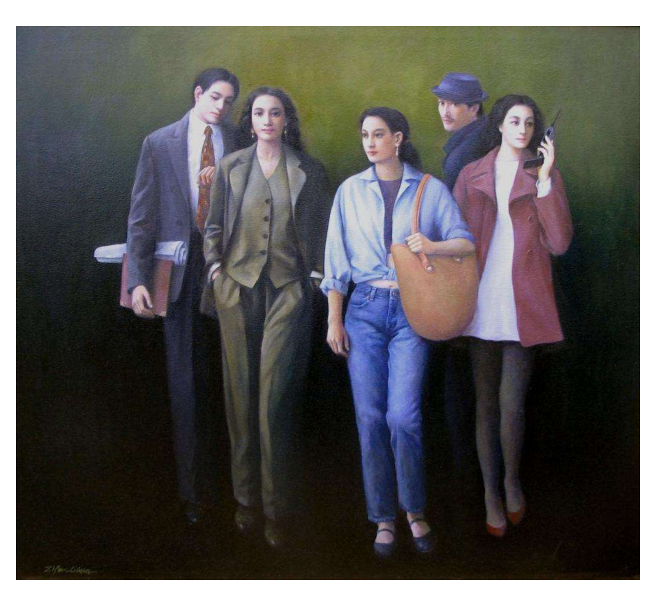
Young Citizens oil on canvas 44" x 50" 1997