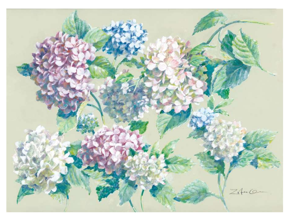
Hydrangeas watercolor 22"x 30" 2008