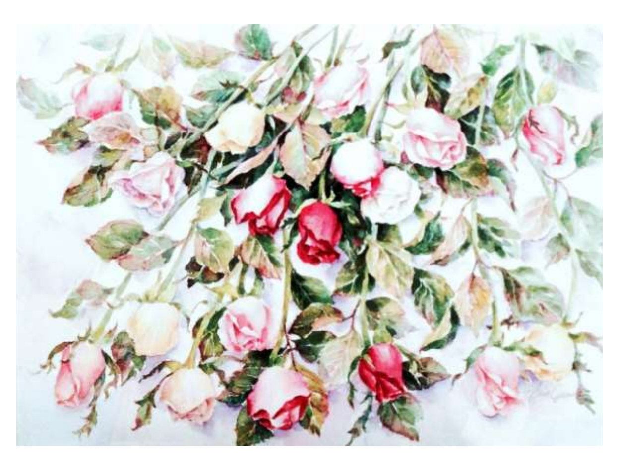
Rosebuds watercolor 14"x 20" 2000