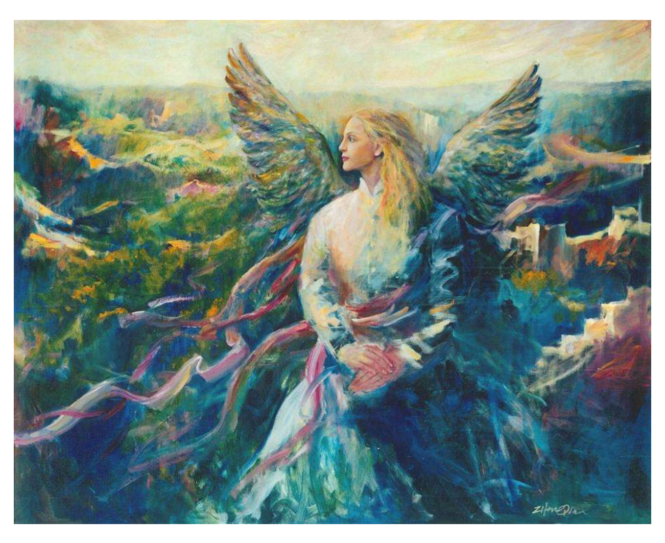
Light Of Millennium oil on canvas 48"x 60" 2000