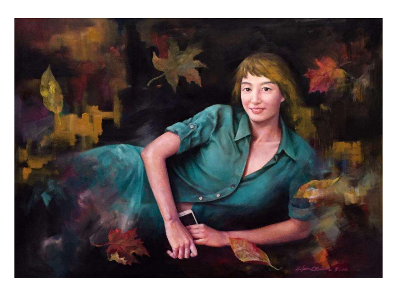
Autumn Melody oil on canvas 40" x 56" 2016