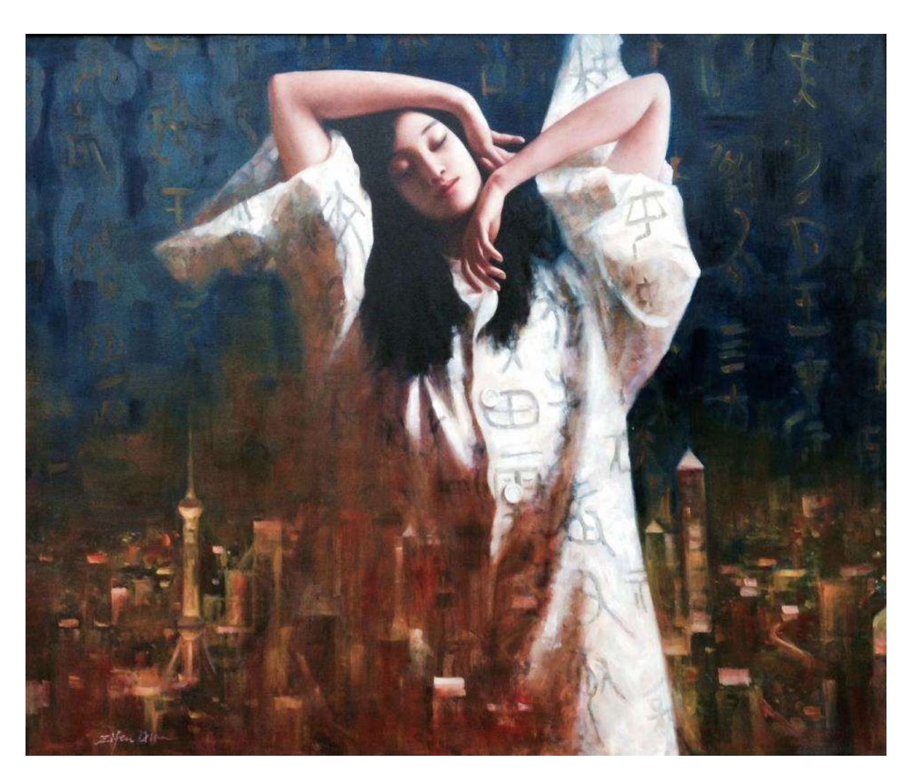
China Dream oil on canvas50" x 60" 2007