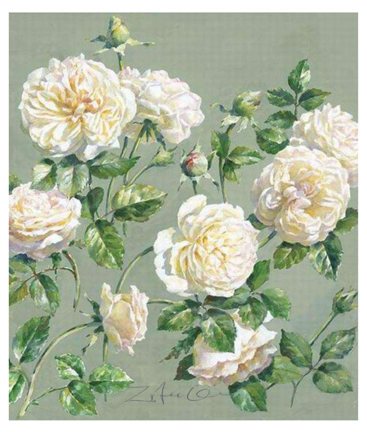
White Roses watercolor 30" x 20" 2009