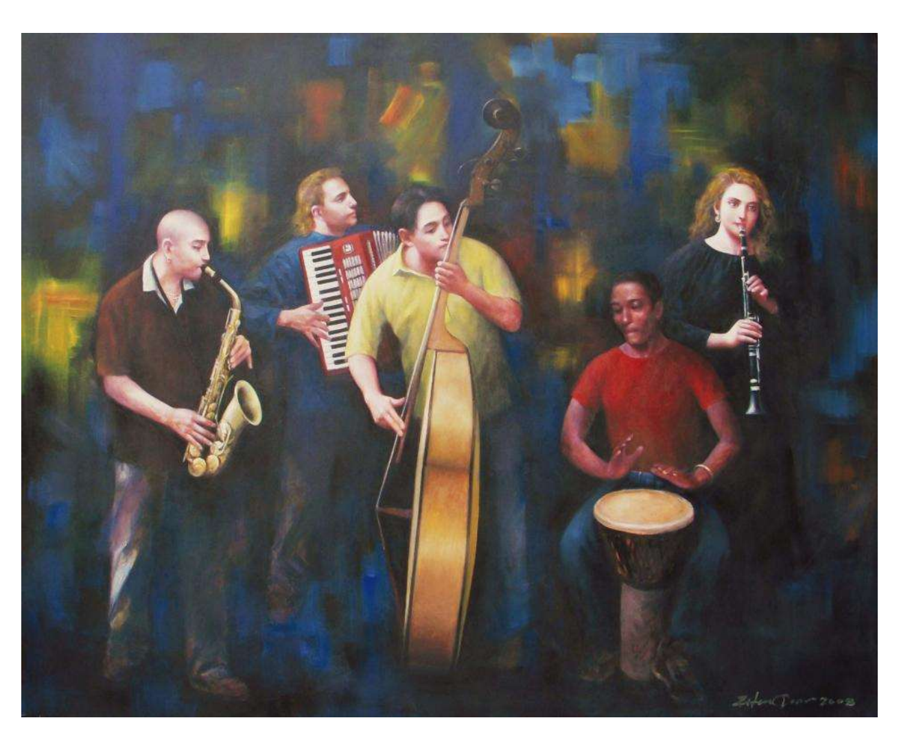
Quintet oil on canvas 58"x78" 2008