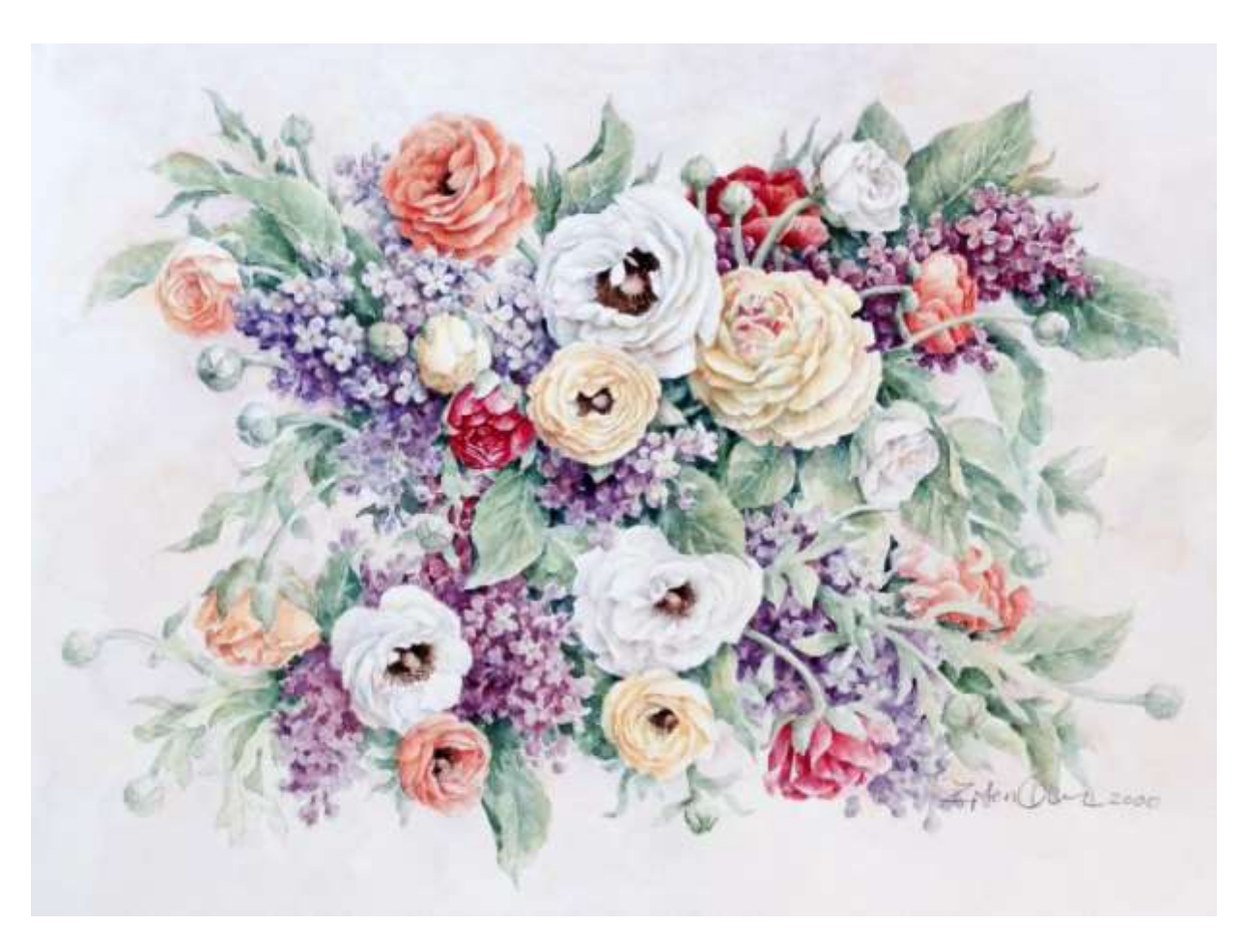
Flower Party watercolor 18"x 22" 1999