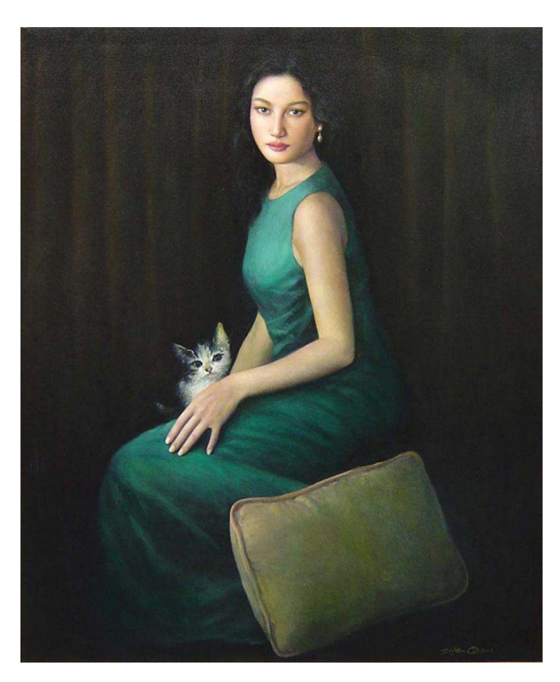
Summer Night oil on canvas 50"x 42" 1996