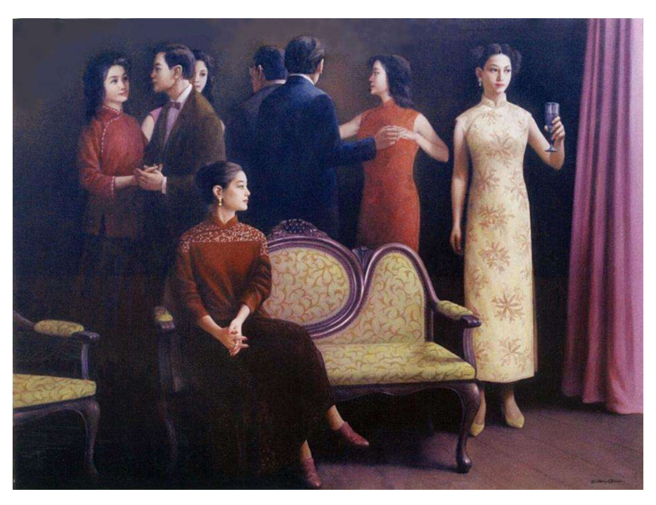
Moon Light oil on canvas 42"x 56" 1993